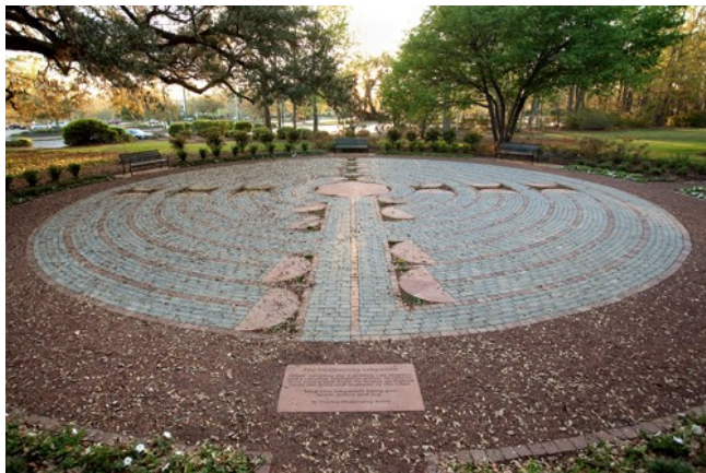
An example of one style of a labyrinth.

Each of us will walk the path in our own way, but for all of us it will be a time to block out the secular world and become closer to God.